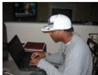
At home, working on my music

to inspire and I wish you all well in the pursuit of happiness.